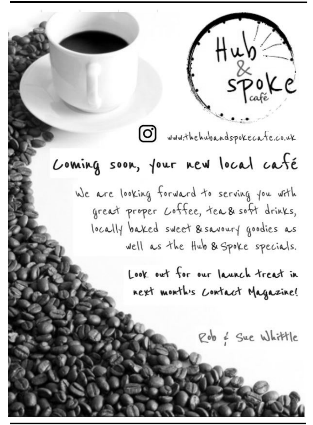
Page 16 February 2021 Harlington Village Magazine